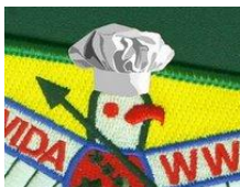
The Kawida bird doing some cooking!