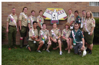
2006 NOAC Contingent Kawida Lodge Michigan State University