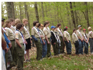
New OA Members lined up after receiving their sash.